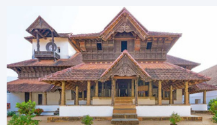
Padmanabhapuram Palace (65 km)