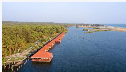
Poovar island( 27 Km)