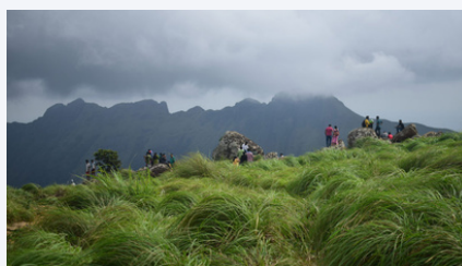
Ponmudi, Kallar River(55.2 km)