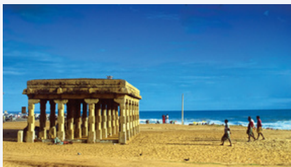
Shankumugham beach(13 km)