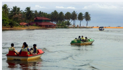
Veli Tourist Village( 14.6 km)