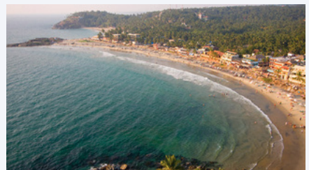
Kovalam beach ( 18km)